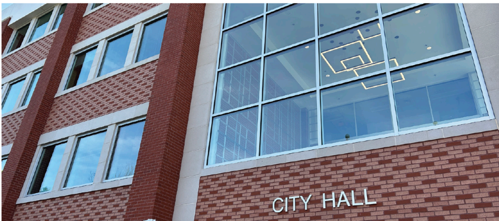
The renovated City Hall at 9027 Center St. is now open for business

"I believe our residents and customers will find the new layout easier for them to navigate and conduct business. It also adds a much-needed community conference room, something our community has asked for. I am glad to have staff back in one location so we can be more efficient in our operations."