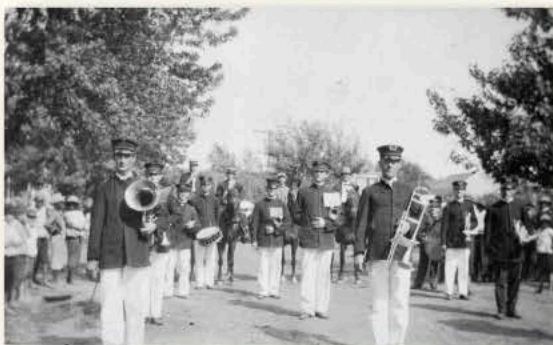
The Manassas Town Band in the early 1900s

Long before concerts at the Harris Pavilion, young men in the Manassas Band performed on warm summer evenings at a bandstand at the corner of Center and Main Streets. Members were farmers, factory workers, and shop keepers who practiced in the evenings. The band performed at the Alexandria Washington's Birthday parade and at firemen's conventions across the state.