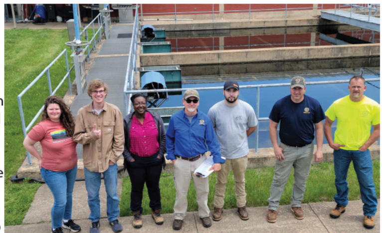
The team at the Water Plant