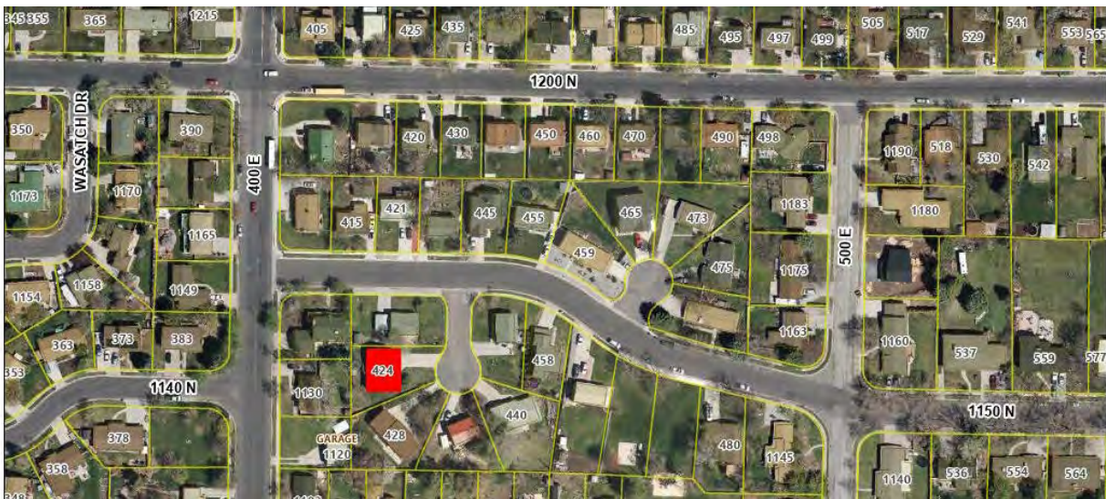
Figure 1 shows the single-family home at 424 East 1150 North.

The applicant is requesting a Conditional Use Permit (CUP) for a new short-term rental (STR) of three (3) bedrooms of the single-family home located at 424 East 1150 North. All three bedrooms are on the main floor of the home. The applicant proposes the basement will be inaccessible to guests. The submitted site plan shows the home, garage, and driveway with parking stalls indicated. The NR-6 zoned parcel is approximately 0.18 acres in size and located in the Adams Neighborhood.