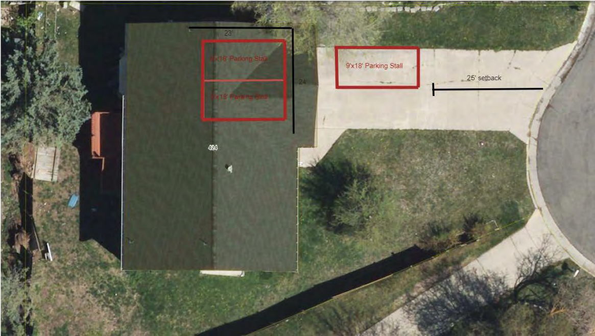
Figure 2 shows parking plan

The application includes a site plan that shows three (3) parking stalls on the property. Two (2) of the stalls are in the garage, and one (1) is in the driveway. The driveway is approximately 18 feet wide by 50 feet long and entirely paved. The driveway parking stall being proposed is outside of the front setback (25 feet) and sized at 9'x18'. As proposed, the parking stalls comply with the standards in the LDC.