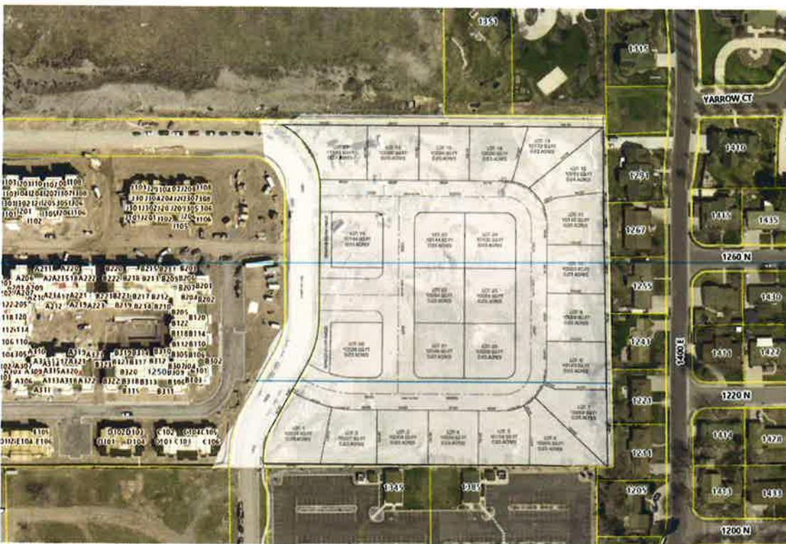
Figure 1 shows the 25-lot proposal on the 8.37-acre property Project #20-059 Foothill Residential Subdivision

The proponent is requesting a 25-lot single-family subdivision. The square-shaped property slopes slightly downward from east to west and sits between older single-family homes to the east and the new Foothill Lofts apartments to the west. To the south, sits two churches and partially vacant land is downslope to the north. The proposal shows lot sizes ranging from 10,004 SF to 12,531 SF. The layout creates an inner block with an outer perimeter of lots accessed by a looping 60' wide road. The proposed layout shows three (3) street connections onto 1300 East and a storm water retention area along the west border.