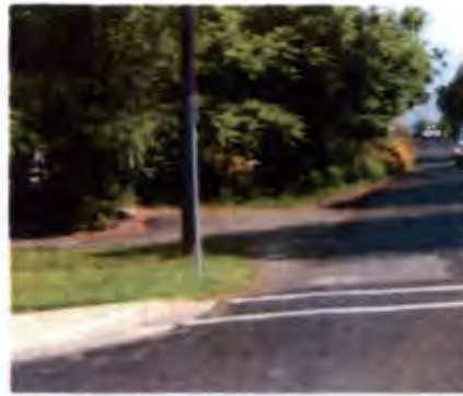
600 N 600 E Looking North