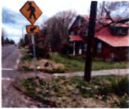
600 N 600 E Looking South