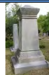
Die, Base & Cap