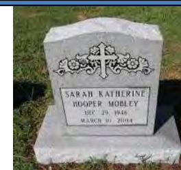
Die On Base