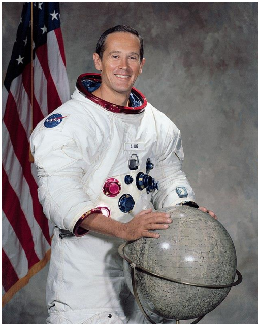
Charles M. Duke Jr. Brigadier General, USAF, Ret.

There are 12 U.S. astronauts who have walked on the moon. One of the twelve is Lancaster's Charlie Duke. 50 years ago, April 1972, aboard Apollo 16; Duke and his crew landed on the moon. Now, 86 and living in Texas, he still travels for speaking engagements, etc.