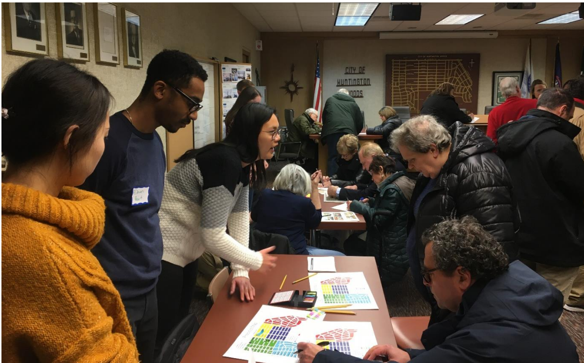
February 25, 2020: Huntington Woods residents engage with the Senior Lifestyle Team in a mapping activity at the City Hall open house meeting.

The feedback from all three activities is summarized in this document and is the primary basis for the Senior Amenities and Lifestyle Analysis . Quotation marks ("..") are used to identify directly transcribed written feedback - all other content is summary of the events as recorded by the Senior Lifestyle Team.