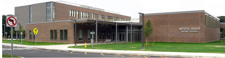
Mystic River Magnet Elementary School formerly Cutler Middle School