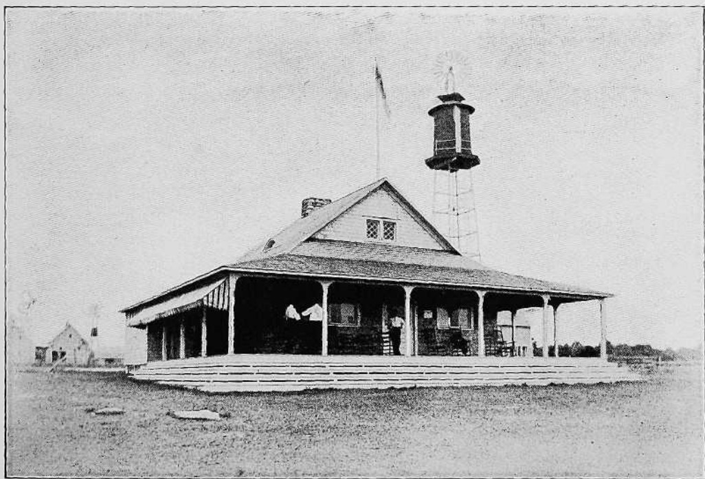
CLUB-HOUSE, SHENNECOSSETT (GROTON, CONNECTICUT) GOLF CLUB.

The Shennecossett Golf Club was organized as far back as 1898, and has had a prosperous career from the start. It is situated three miles from the New London (Connecticut) railroad station, and has a nine-hole course, of which the