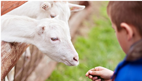
Funded by the Circle of Friends.