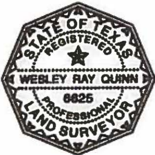
Registered Professional Land Surveyor Texas Registration No. 6625