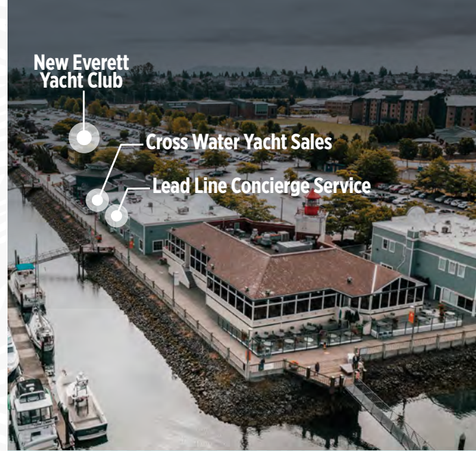
On August 4, 2021, Everett Yacht Club held a Grand Opening Ceremony to celebrate their new reciprocal moorage dock at the Port's South E-Dock.

The change in the Club's location was nearly five years in the making and opens the door for the Port to begin moving forward with plans for the second phase of Waterfront Place. The Port will market the marquee site for a new dual destination restaurant concept on the water. The Central Dock building is beyond its useful life and slated for demolition, with reconstruction to take place once a tenant is secured.