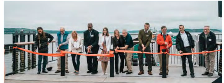
ABOVE: Local leaders and project partners joined Port representatives to cut the ribbon at the new fishing pier grand opening on June 23, 2021.