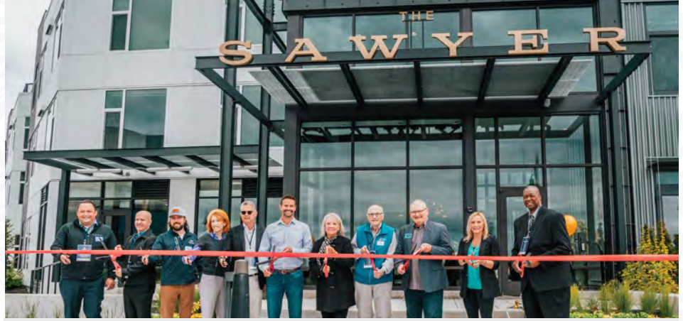
Above: Port of Everett and City of Everett officials join project partners and community leaders to celebrate with a ribbon-cutting and remarks at the May 26 Waterfront Place Apartments Grand Opening.

With demand continuing to rise, the Port has issued a Request for Qualifications to seek developers for the second phase of mixed-use development at Waterfront Place in the Millwright District (see right). This phase will add more housing, retail, commercial and public open spaces at the waterfront.