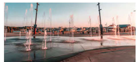
The Port’s new splash fountain at Pacific Rim Plaza is officially open to the community!

December 4 HOLIDAY ON THE BAY Port of Everett Waterfront portofeverett.com