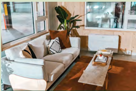
The 1,200-square-foot prototype, with two bedrooms and one bathroom, is a new template for keeping communities stable, modernizing building techniques and creating rural jobs.

Forterra's Forest to Home vision aims to revitalize rural economies and create local jobs. Forterra is currently seeking development partners and manufacturing expertise for the Darrington Wood Innovation Center.