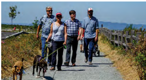
Visitors enjoy a stroll along the new Bay Wood Nature Trail in July.

A project that cleaned up a once-challenged shoreline and restored habitat at the Port of Everett's former Bay Wood property culminated with the opening of a new nature trail.