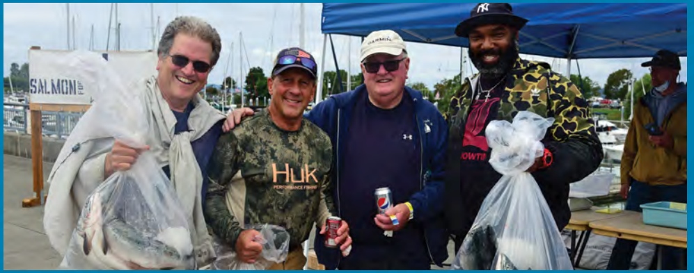
Salmon for Soldiers treated nearly 800 veterans to fishing trips last year. The next one is Sept. 17.