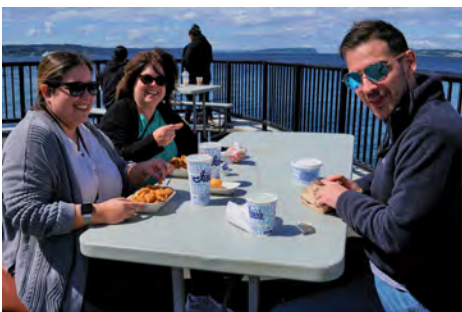
Temporary picnic tables at the new Mukilteo parklet provide dining with a spectacular view.