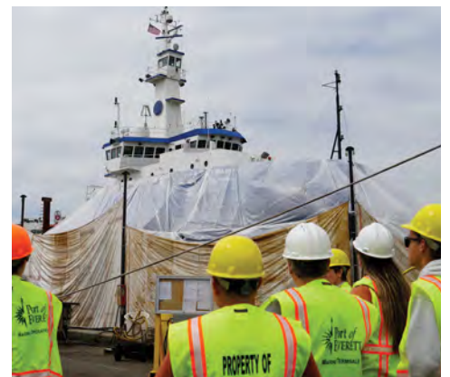
Visitors got a first-hand-look at maritime jobs, including an on-site visit to Everett Ship Repair.

Recent tours have been given to the Washington chapter of Women in Manufacturing, Mill Creek Elementary STEM fourth graders, Edmonds Community College students in Construction Pre-Apprenticeship Programs, the Everett Public Schools Engineering and Manufacturing Program Advisory Committee and the Washington Alliance for Better Schools.