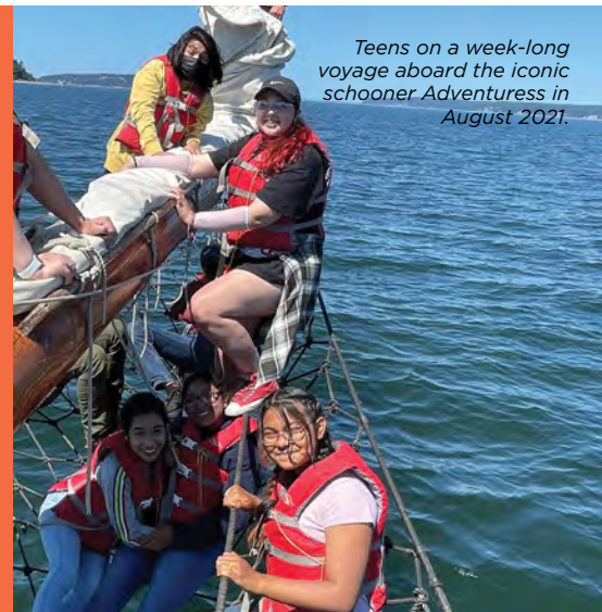
Teens on a week-long voyage aboard the iconic schooner Adventuress in August 2021.

These voyages on the 133-foot sailing ship Adventuress are paid for by