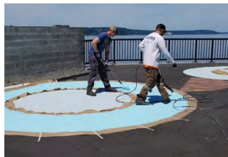
FORMA Construction employees paint bubble-like circles on the pavement as part of the Port's public parklet enhancements.

The Port of Everett and Ivar's Mukilteo Landing have added expanded outdoor dining and picnic tables to Mukilteo's new parklet. The area opened to the community on Memorial Day weekend.