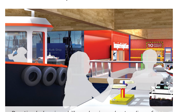
Practice balancing skills and gain understanding of weight distribution as you load a table top cargo vessel.

The Port of Everett and Imagine Children's Museum have a long-standing partnership to engage and educate the youth of our community about the critical importance of ports. In support of this partnership, and with the goal of continuing to build on the success of our youth outreach, the Port is committing $100,000 in marketing dollars over a five year period toward the Imagine Children's Museum capital expansion project now underway at their downtown Everett facility. This funding will support a new maritime exhibit being constructed at the museum — Import. Export. Our Port. The exhibit will offer a hands-on, visual learning experience for the 230,000 annual museum visitors, and also, greatly broaden awareness of the economic impact of the Port of Everett Seaport.