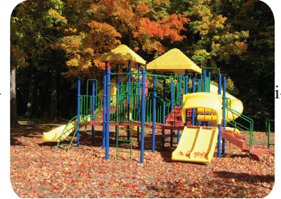
Play structure at Grand Woods Park

We strive to provide a setting that leads to a strong quality of life for township residents. A large part of Delta Township's strategy is our robust parks system. We are in the process of adding to our parks system, officially purchasing Grand Woods Park from the City of Lansing. Delta Township has leased and maintained this park for its residents for many years, and will now formally add it to our parks system. In 2015, we completed the purchase of 60 acres of park space on Mount Hope Highway with a grant from the State of Michigan Department of Natural Resources. The property is adjacent to 60 acres the Township already owned and is envisioned as a park on the West side of Delta Township, where no park space or ballfields currently exist. Planning for the development of Mount Hope Park is underway and will add to our diverse parks system and add additional opportunities for recreation!