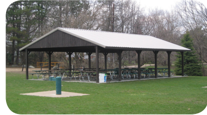
Grand Woods Shelter