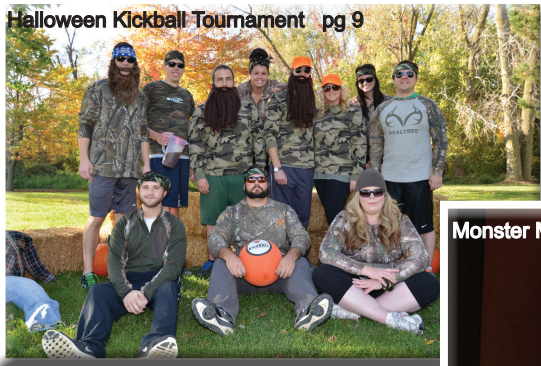
Halloween Kickball Tournament pg 9