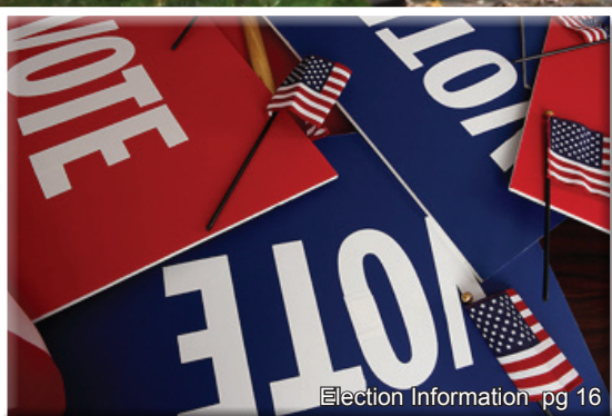
Election Information pg 16