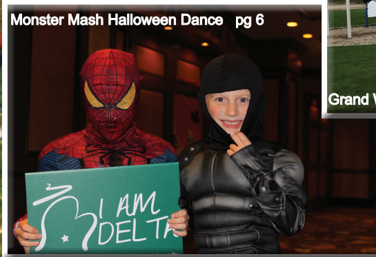
Monster Mash Halloween Dance pg 6