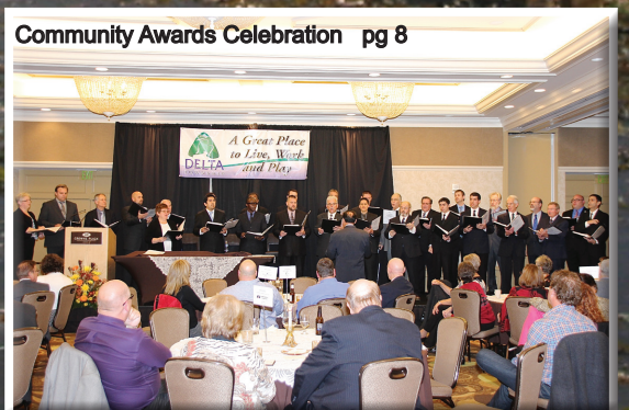
Community Awards Celebration pg 8