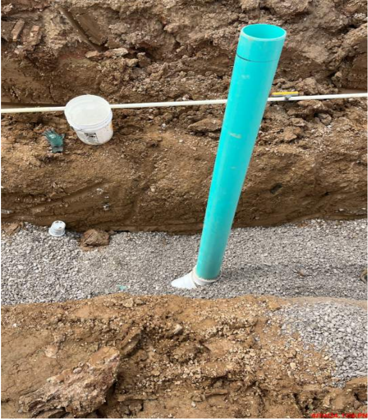
Underground Sanitary Sewer Line and Cleanout Installation