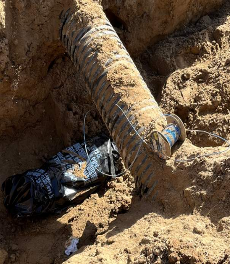
Watermain Installation In-Progress