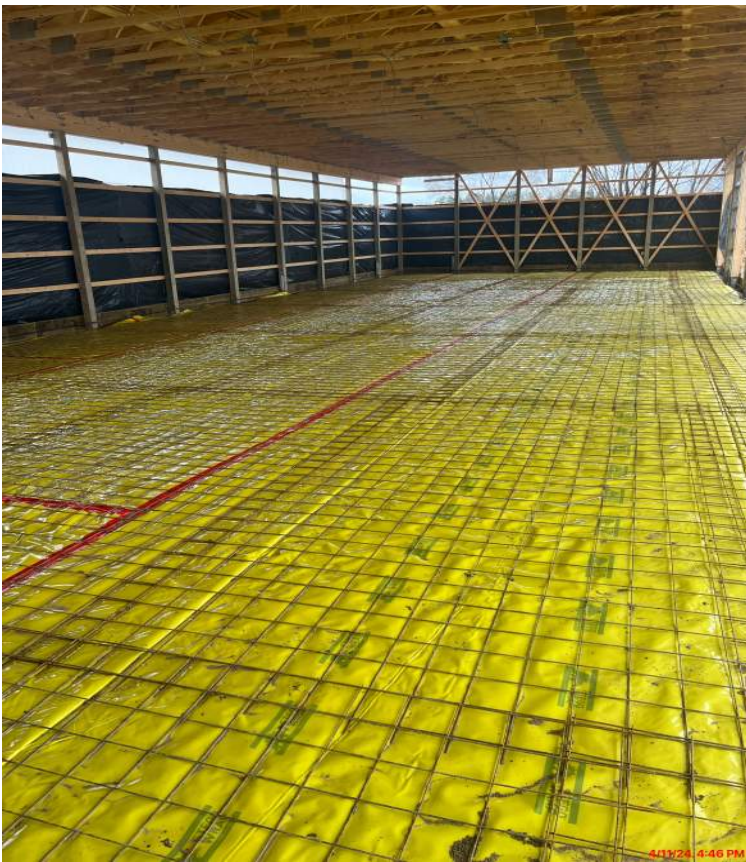
Cold Storage Building Slab on Grade Preparation