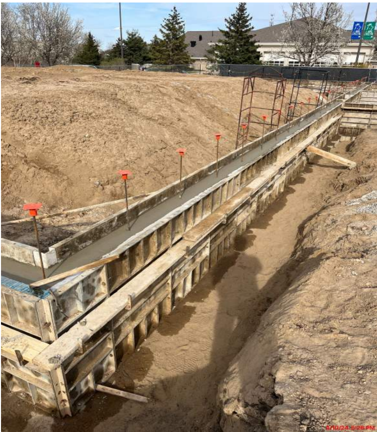
Sheriff Station Building South Foundation Wall