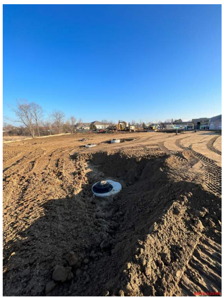
Storm Drain Lines and Structures