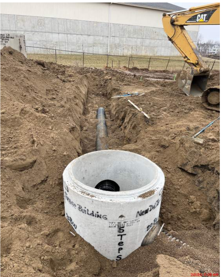
Storm Drain Lines and Structures