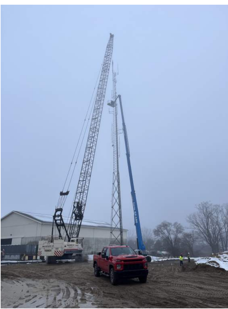
Initial Stages of the Radio Tower Demolition