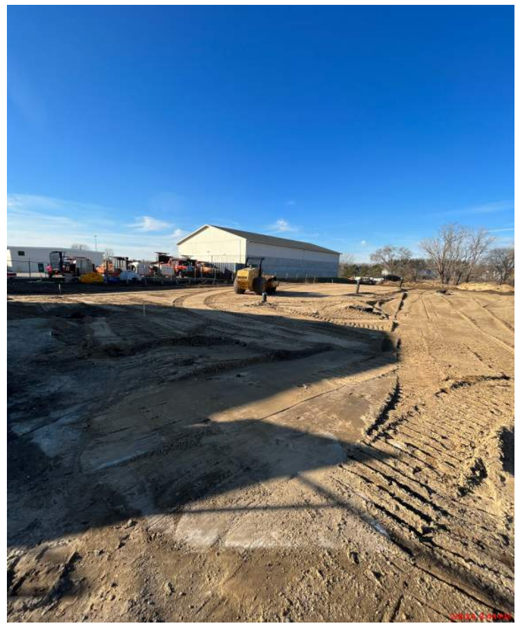
Cold Storage Building Pad