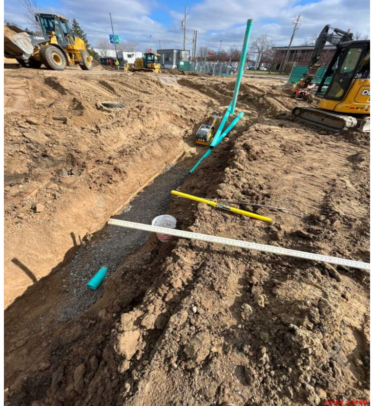
Underground Sanitary Sewer Installation