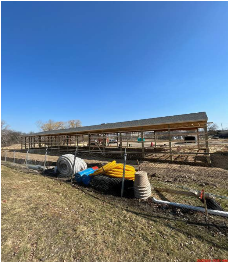
Cold Storage Building with Shingled Roof