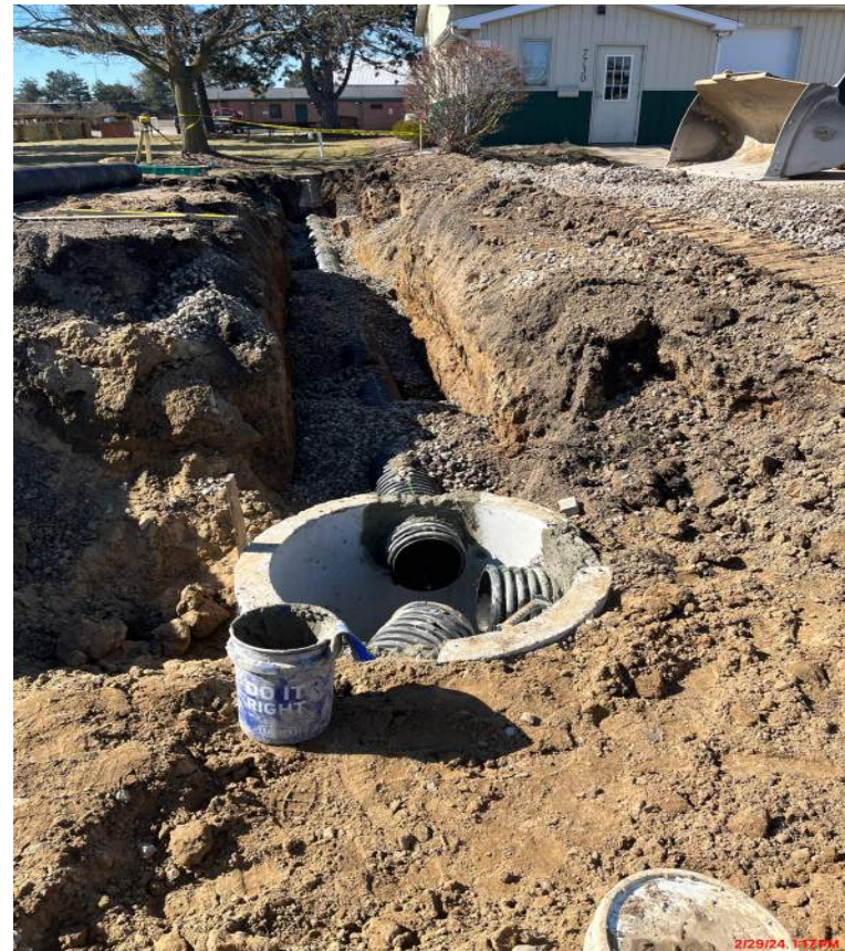
Underground Storm Line that Traverses the Parks and Rec Driveway