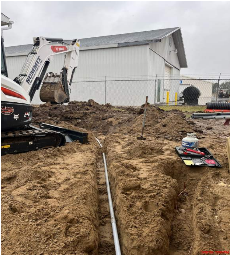
Underground Electrical for the Cold Storage Building