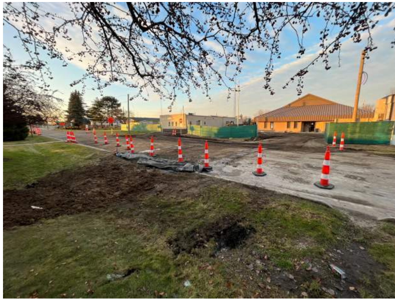
Admin Drive - Backfilled, Compacted and Ready for Asphalt