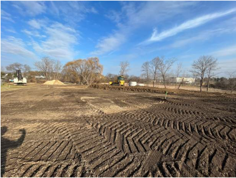
Underground Detention System - Earthwork Prep