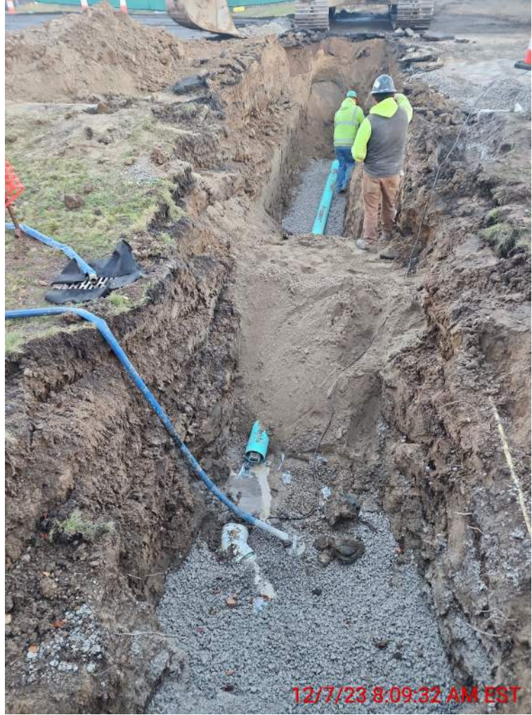
Admin Drive - Sanitary Line Installation