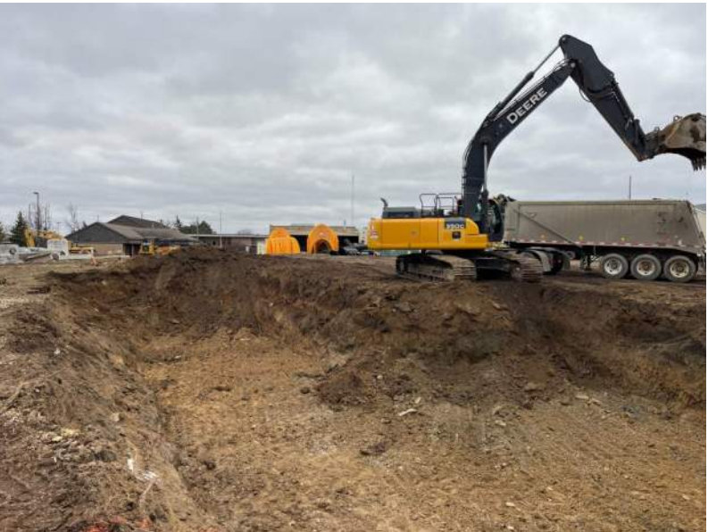
Underground Detention System - Excavation In Progress