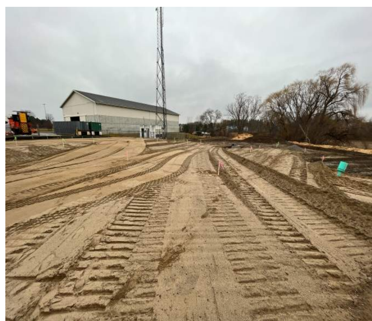
Cold Storage Building Pad and Site Survey Flags