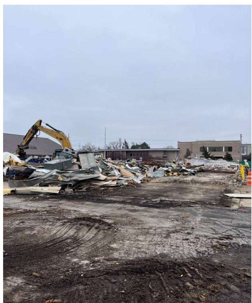
Demolition of the Sheriff Station and Storage Building