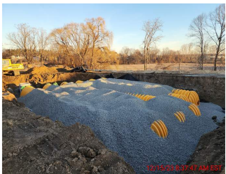
Underground Storm Detention System