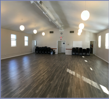
Upstairs facing the entrance hall. There are windows all along the east and west walls.