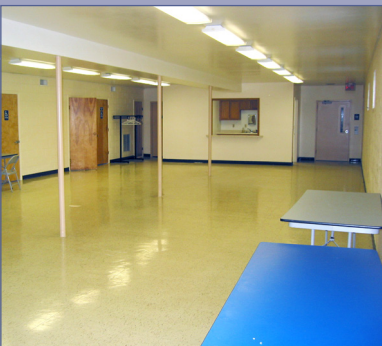
Downstairs facing the kitchen serving window. There are small windows along the east wall.