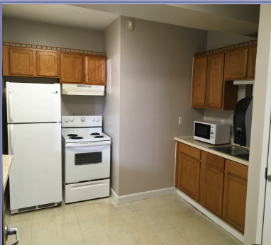
The downstairs kitchen includes a refrigerator, stove/oven, and sink, and has a serving window with counter space.