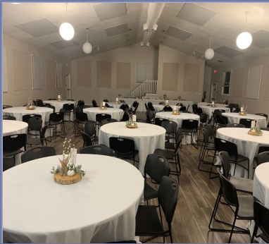
Upstairs with possible seating arrangement. There are colored lights where you can put a dance floor. Emergency exits on both corners of the room.