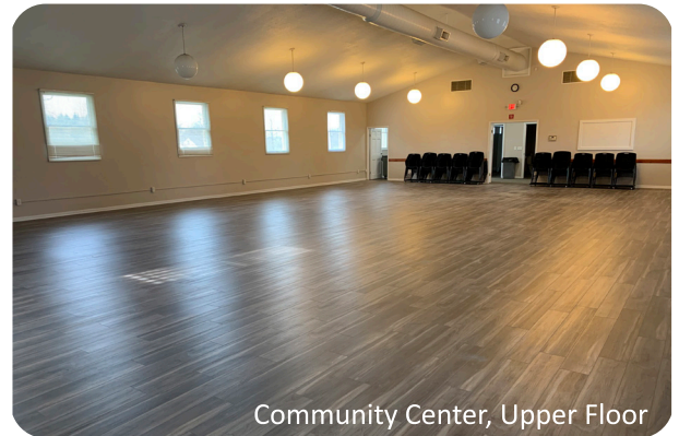
Community Center, Upper Floor

The entire building is handicap accessible, air-conditioned, and non-smoking. Use of the kitchen, oven, stove, sink, electricity, tables, and chairs are included in the rental.