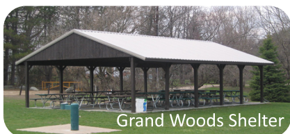
Grand Woods Shelter

Check availability and reserve by calling 323-8555.