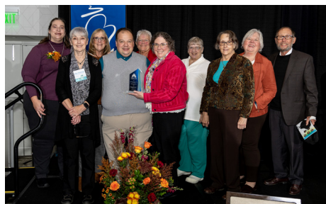
Community Organization of the Year The Delta Community Choir

Delta Township hosted the 16th Annual Delta Township Community Awards Event on October 28 at the Crowne Plaza Lansing West. Over 150 people gathered to celebrate the outstanding individuals, businesses, and organizations that were honored during the event.