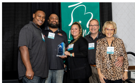
Business of the Year The Smoke N' Pig BBQ