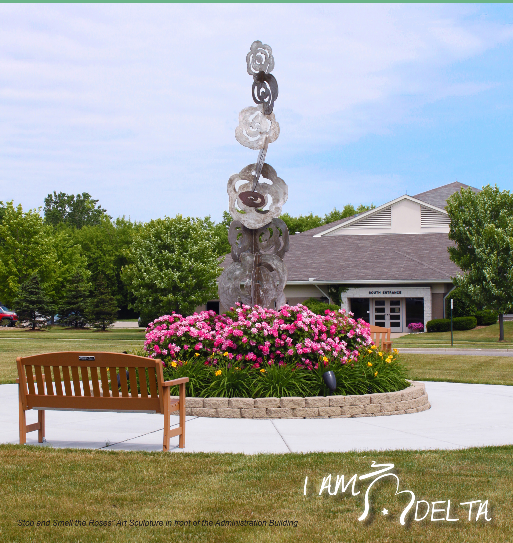
"Stop and Smell the Roses" Art Sculpture in front of the Administration Building