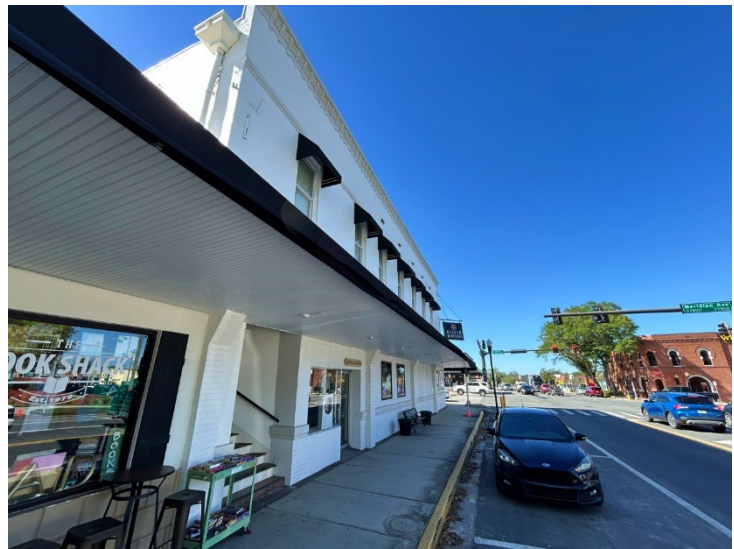
Old City Market (1905) 27-24-21-0280-00400-00A 14148 8th St Currently Green Door On 8th