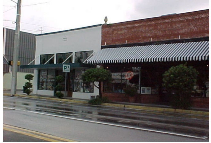
Old Barber Shop (1916) 27-24-21-0280-00400-00E1 14145 7th St