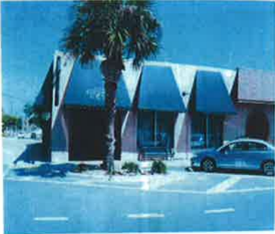
Greenfelder block: BEFORE