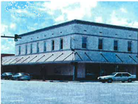
Kiefer Building: BEFORE