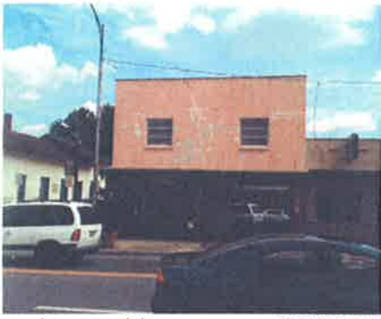
Larkin Building: BEFORE