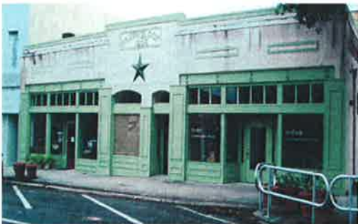
Huckabay Building: BEFORE