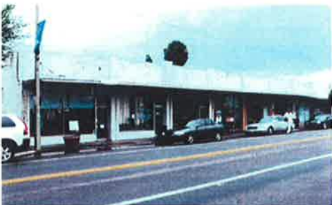
Mander Building: BEFORE