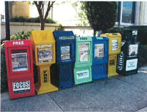
Newsracks at City Hall: BEFORE

To promote uniformity and an historic look along the streets, CRA contracted with the St. Petersburg Times to install newspaper racks that would consolidate both paid publications and free neighborhood newspapers in central locations. Two boxes were installed: one in the 8 th Street parking lot and one at City Hall, for a total cost of $468.48. The style and color were chosen to match the benches and trashcans that were installed throughout the CRA in the last fiscal year.