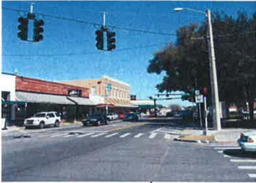
Looking north along 7 th St.: BEFORE

For several years, the CRA had researched replacing streetlights along the 7 th Street CRA area with historic lightpoles and period lights. This year the project came to fruition. In a cooperative venture with TECO Energy, 84 streetlights were installed in CRA #1 and 16 in CRA #2. All wiring was moved underground, creating a uniform look and greatly improving the appearance of lighting in the Downtown area. In addition, light levels were addressed to ensure more uniform light and better lighting at street level. Total cost for directional boring, asphalt and concrete work was $70,988.46.