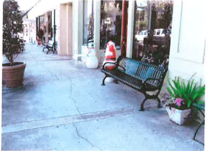
Bench along Meridian Avenue