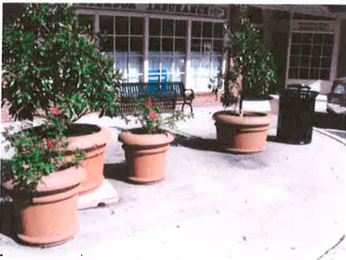
Planters, bench & trashcan