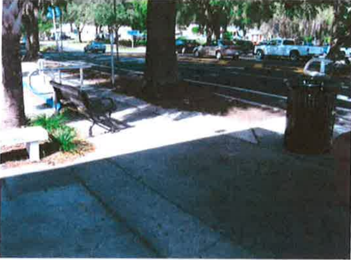
Bench & trashcan on Meridian Avenue