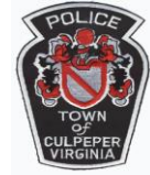
Culpeper Police Department 8 Year Internal Affairs Statistics

Town of Culpeper Police Department An Internationally Accredited Agency 740 Old Brandy Road, Culpeper, Virginia 22701 (540) 727-3430 Fax: (540) 727-7528