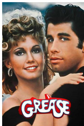
Friday, July 22nd