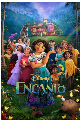
Friday, June 10th