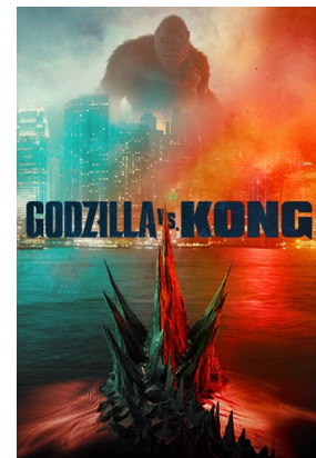
Friday, August 19th