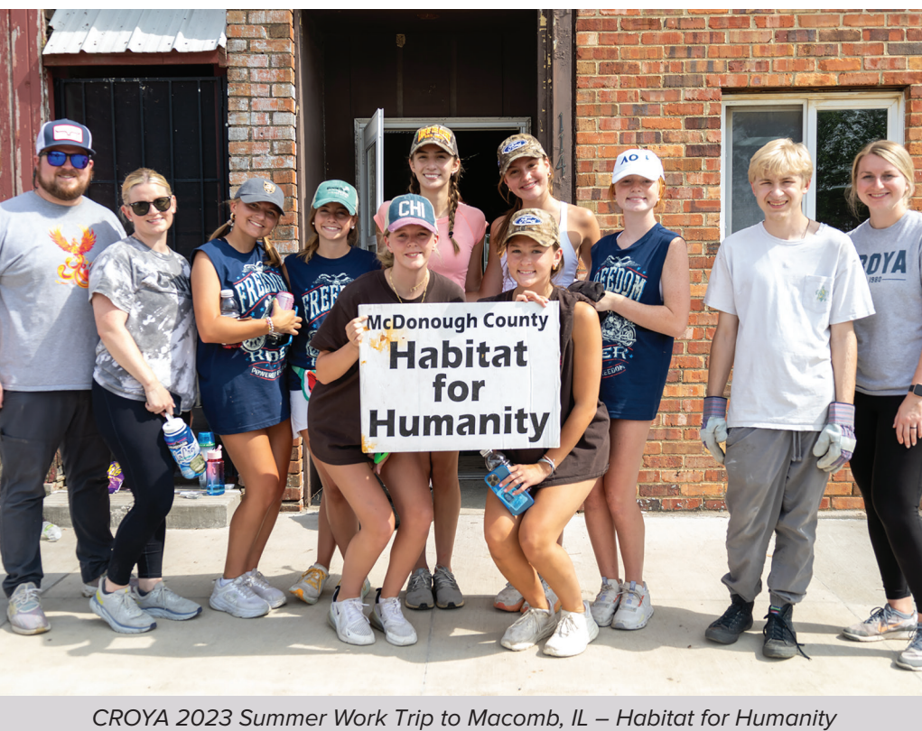
CROYA 2023 Summer Work Trip to Macomb, IL – Habitat for Humanity