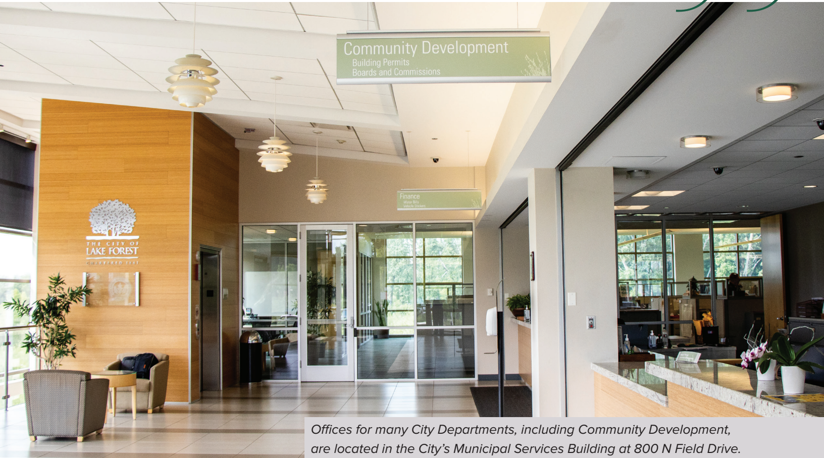
Offices for many City Departments, including Community Development, are located in the City's Municipal Services Building at 800 N Field Drive.

How does the typical process work? The department staff offers advice to property and business owners, architects, and contractors and even those considering moving to Lake Forest early in the process. Once a project begins to take shape, the Community Development staff outlines the required approval process. If Board or Commission review is required, City staff guides the property owner and architect through the application and public hearing process.