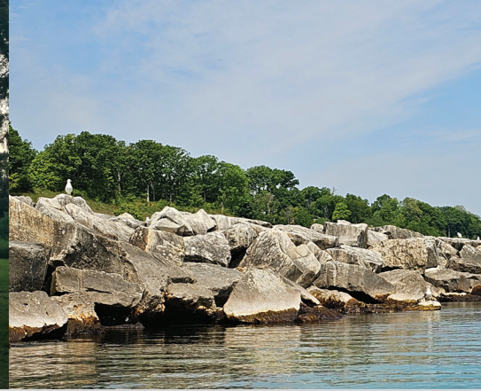
Summer Photo Contest submissions.