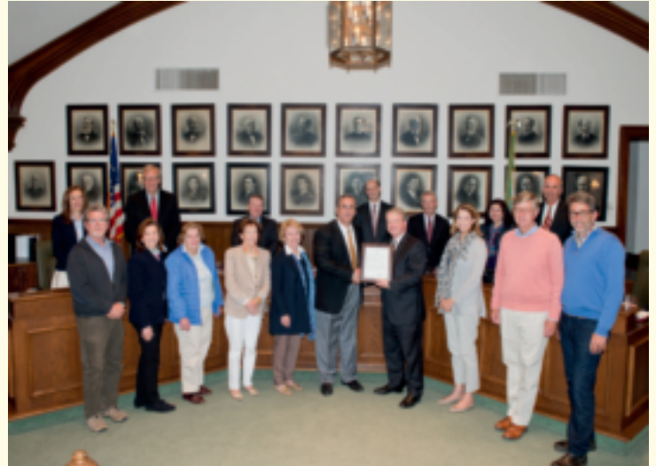
The Forest Park Project Board