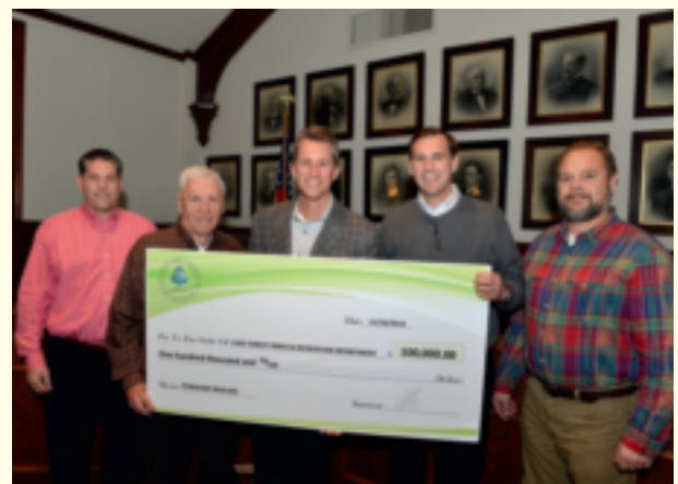
The Friends of Lake Forest Parks and Recreation