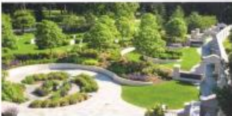
Columbarium and Memorial Gardens

A Gothic style Columbarium Wall, providing for the above ground burial of cremains, was dedicated in June 2000 on the southerly border, just east of the Barrell Memorial Gate. Adjacent to the wall are the Memorial Gardens, a series of intimate garden settings that include a fountain and a pool in the tradition of the Prairie style of landscape gardening. Jacobs/Ryan Associates, landscape architects, designed the gardens. Architect Alan Rosezweig designed both the Columbarium and the medieval style Cemetery Gatehouse, which was constructed at 520 East Spruce Street in order to serve the needs of the public. The Columbarium will extend the viability of the cemetery for many decades to come.