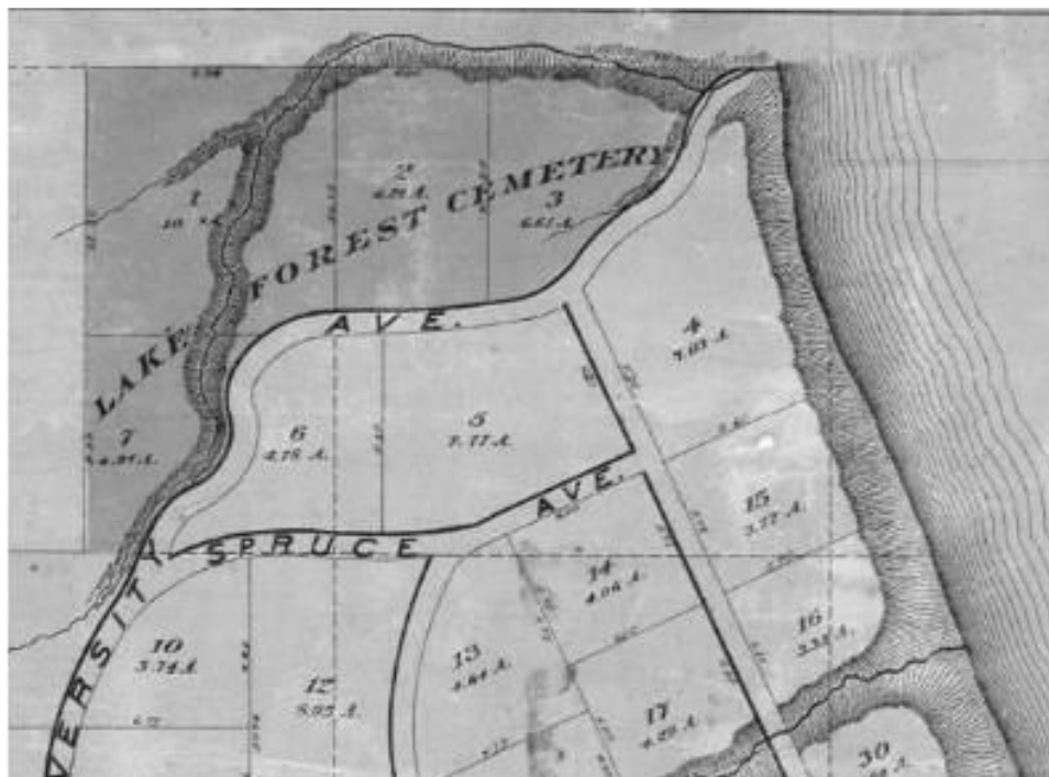
Map of Lake Forest, 1873