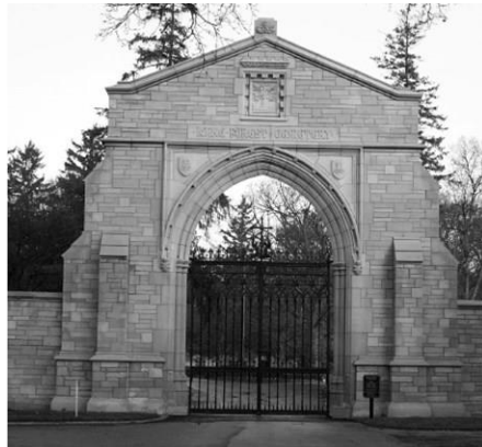
Barrell Memorial Gate