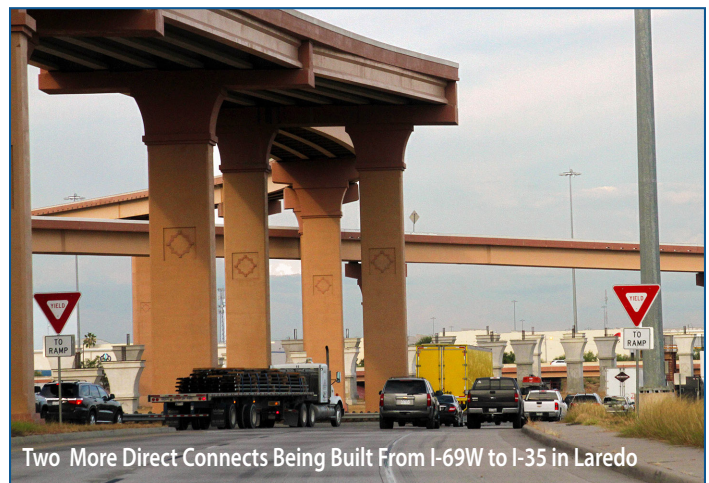
Two More Direct Connects Being Built From I-69W to I-35 in Laredo

support implementation of the Boarder Master Transportation Plan as it relates to I-69.