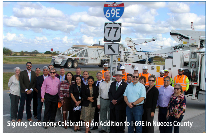
Signing Ceremony Celebrating An Addition to I-69E in Nueces County