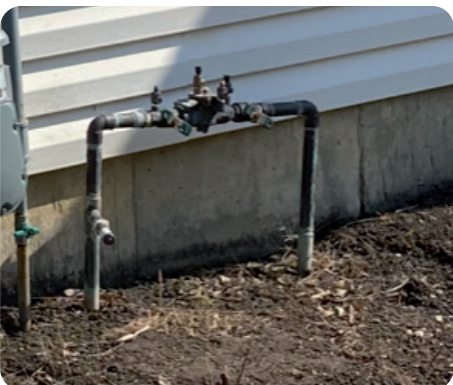
Backflow prevention valve

Did you know that if you have a lawn sprinkler system on your property, you need to have the valve tested every year to help protect the Village's drinking water system?