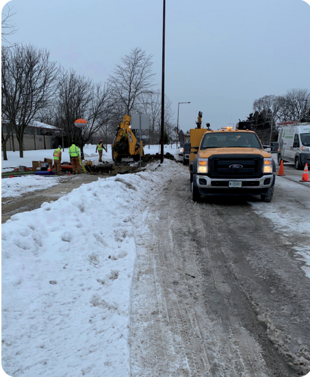
Public Works crews worked on a water main break overnight February 10 on Aptakisic Road west of Buffalo Grove Road. Water delivery to residents was fortunately not affected, but the Twin Creeks Park District building was without water until the break was fixed. Crews repaired the main amid freezing temperatures.

A water main has an expected life cycle of between 50 to 75 years. Buffalo Grove was incorporated in 1958, and many of the Village's housing