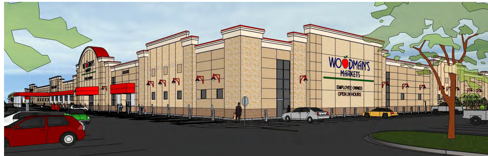
South East Perspective