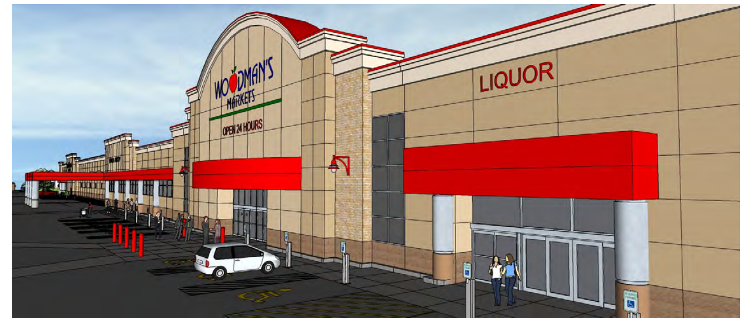
Enlarged South East Perspective