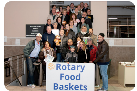
2019 Buffalo Grove Rotary Club Thanksgiving Food Basket Program

Food Baskets to families in need, who are identified by social workers from local school districts. In the weeks leading up to the Thanksgiving holiday, Buffalo Grove Rotarians will volunteer their time and efforts to put together these baskets filled with all the fixings for a delicious holiday meal. This year, the Rotary Club didn't miss a beat despite the pandemic. The club continued to raise funds through their annual Duck Race in early September and will be able to give at the very same level as previous years. There will be more than 150 Thanksgiving Food Baskets distributed to in-need families living in Buffalo Grove and the immediate surrounding areas, just in time for the holiday season.