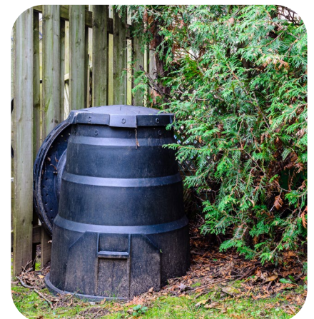
A compost bin like this one can help kick-start your composting process and keeps compost material covered and out of the way.

Using compost helps improve the structure and health of your soil, reduces the need for pesticides and fertilizers and has many other benefits. For more information, visit www.epa.gov/recycle/composting-home .