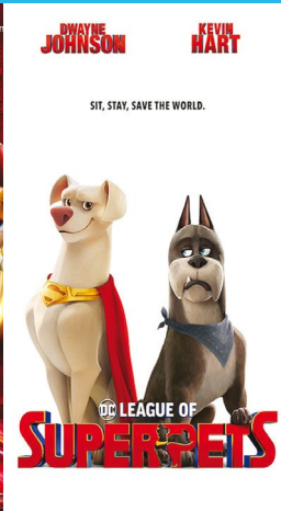
DC League of Super-Pets July 14 (rain date July 20)