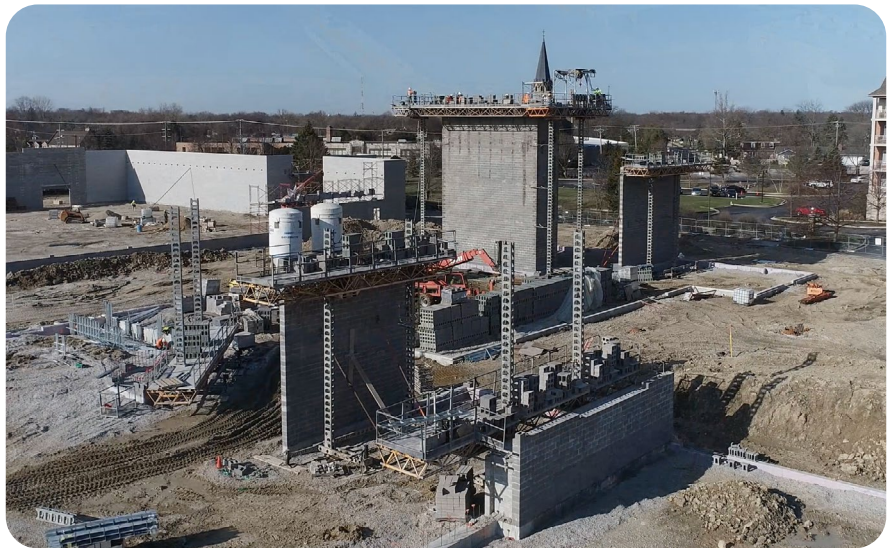
Elevator shafts for the mixed-use residential and commercial buildings stand tall over The Clove construction site.