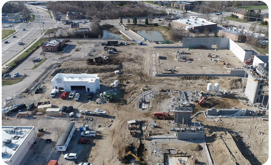
Exterior walls of Guzman y Gomez (above left) have been erected, while the foundation has been laid for the 43,000 square foot grocer (above right).