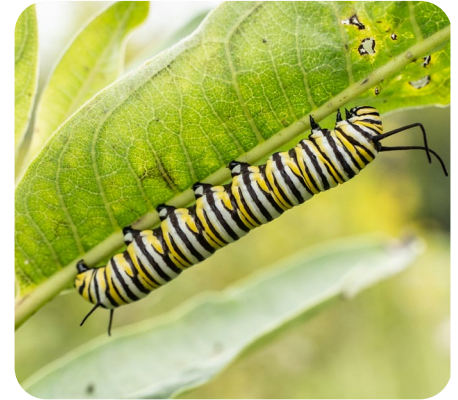
Milkweed helps support the iconic monarch butterfly through its entire life cycle, egg to adult.

When you plant milkweed and native nectar flowers, you help more than monarchs, but many other pollinators too. You may see signs for Monarch Waystations at some gardens around town, signifying these efforts. When you add milkweed to your garden, you can enjoy seeing butterflies on your flowers and know you are helping the environment in a beautiful way.