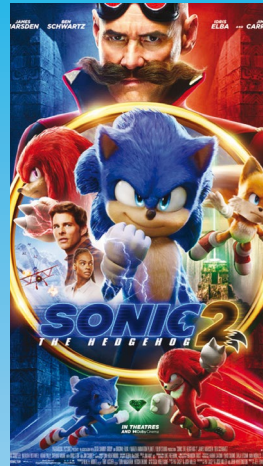
Sonic the Hedgehog June 23 (rain date June 29)