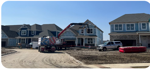
Examples of the 68 single-family homes being built in the Link Crossing neighborhood.

The Link Crossing neighborhood continues to develop. The project brings 68 clustered single-family detached homes, 119 two-story townhomes to the northeast side of Buffalo Grove. Within the neighborhood, Prairie Grove Park, located at 2020 Olive Hill Drive, will see an expansion and improvements including the removal and reconstruction of the playground, construction of a shade structure, plus basketball, tennis and pickleball courts. The park will also feature an open field (for flexible uses), picnic area, walking/bike paths, bike racks, a bike – fix it station and a prairie restoration area with native plantings. The Park District received an Open Space Lands Acquisition and Development (OSLAD) grant for the project and this funding will create a revitalized gathering spot for the community!