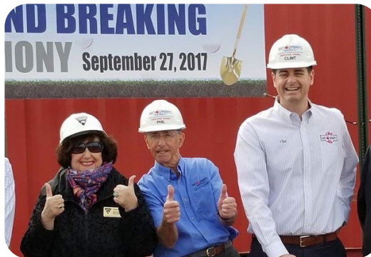
Bringing Woodmans to Buffalo Grove and the surrounding development it spurred was a major achievement for the Village