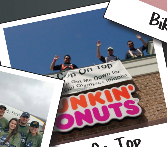
Cop On Top