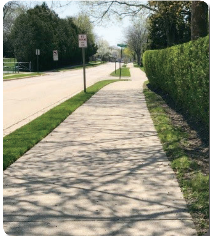
Properly maintained shrubs