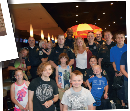
Bowl with a Cop