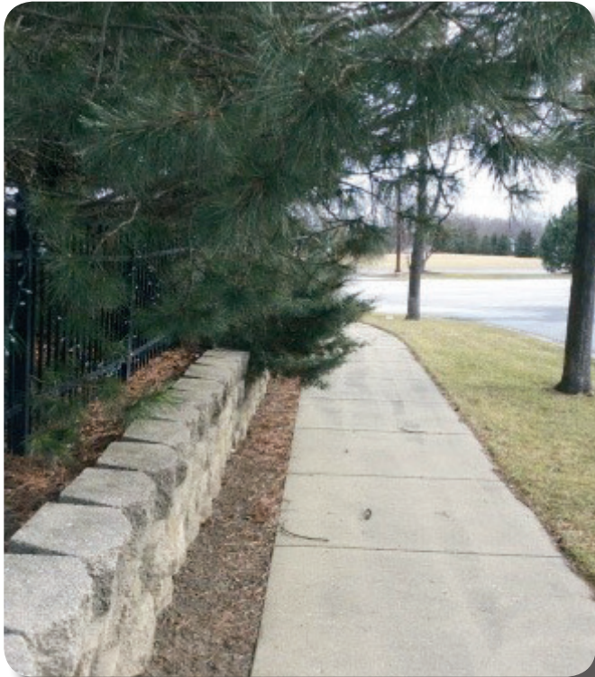
Improperly maintained shrubs

There are approximately 249 miles of sidewalks and bike paths available for public use in Buffalo Grove, and assistance in keeping them safe is greatly appreciated! To help spread the word, the Public Works Forestry Section will be implementing a public service campaign this summer to inform residents of the risks associated with improperly maintained vegetation, in addition to what is required of property owners. Beginning in 2019, Buffalo Grove will begin to enforce violations. More information will be provided to residents prior to any enforcement efforts.