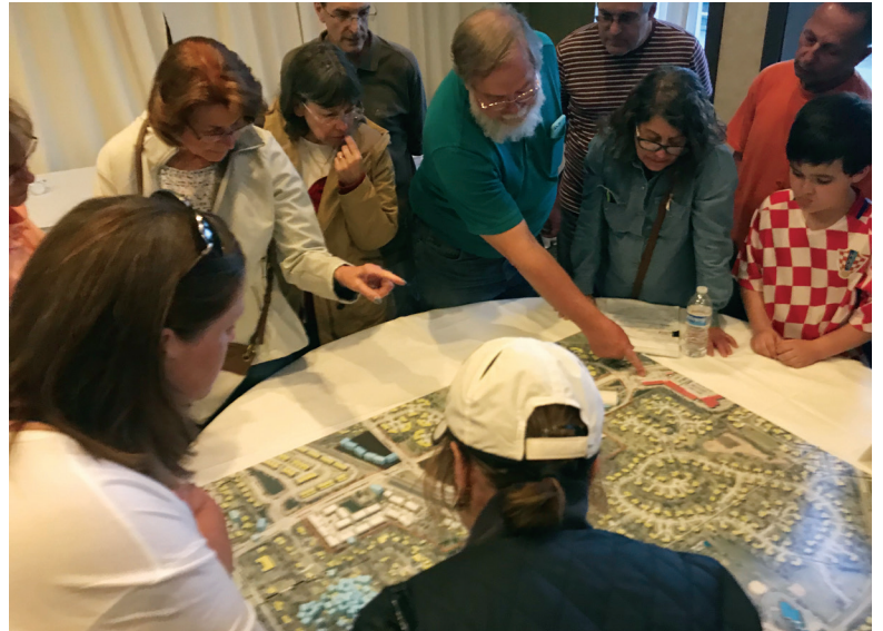
Prairie View Metra Station Plan Open House

The Village encourages the community to be involved in the engagement activities that will help to create the vision and future plan for this area. For more information about the project and to sign up for the project's mailing list, visit prairieviewbg.com . This website will be routinely updated, and will announce additional public engagement opportunities, as well as project updates and other related news.