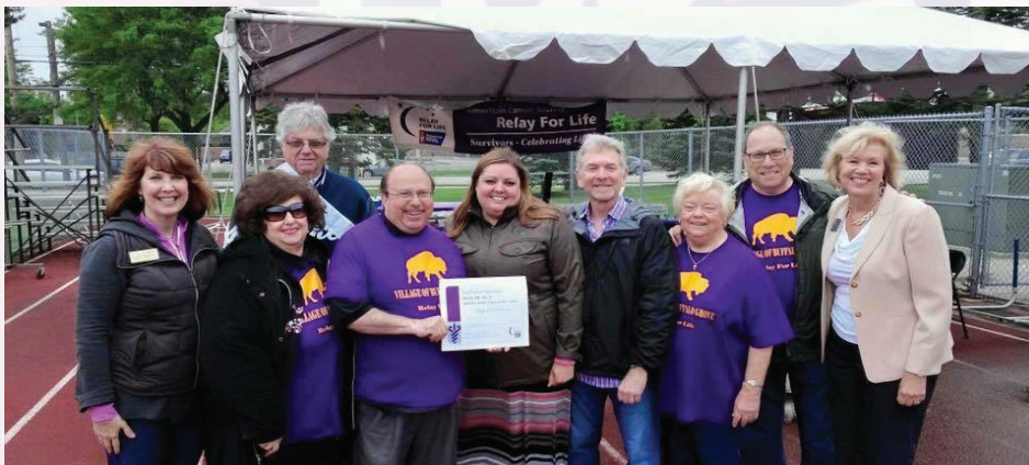
Members of the Village Board Relay For Life team pose for a picture at the Buffalo Grove /Stevenson High School event.

Giving back to the community is strongly encouraged.