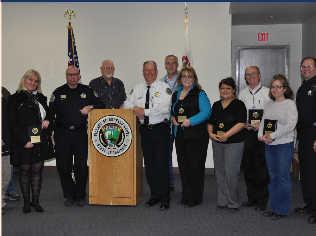
Pictured above are graduates of the 2015 Buffalo Grove Citizen Police Academy

Applications are now being accepted for the Village of Buffalo Grove Citizen Police Academy, which provides Village residents an opportunity to learn about a wide range of law enforcement activities performed by the Buffalo Grove Police Department.