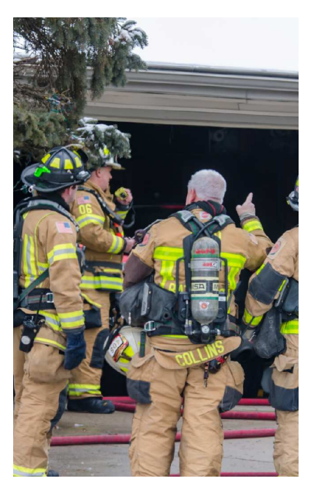
Buffalo Grove BFPC / 2023 Recruitment Packet / Preference Points