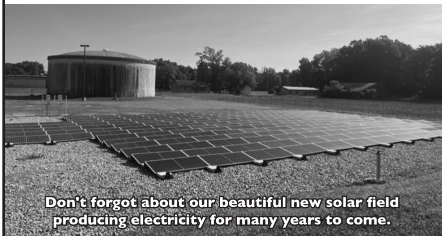
Don't forget about our beautiful new solar field producing electricity for many years to come.

Lead: Lead in drinking water is rarely the sole cause of lead poisoning, but it can add to a person's total lead exposure. All potential sources of lead in the household should be identified and removed, replaced or reduced. If present, elevated levels of lead can cause serious health problems, especially for pregnant women and young children. Lead in drinking water is primarily from materials and components associated with service lines and home plumbing. Boonville is responsible for providing high quality drinking water, but cannot control the variety of materials used in plumbing components. When your water has been sitting for several hours, you can minimize the potential for lead exposure by flushing you tap for 30 sec. to 2 min. before using water for drinking or cooking. If you are concerned about lead in your water, you may wish to have your water tested. Information on lead in drinking water, testing methods, and steps you can take to minimize exposure is available from the Safe Drinking Water Hotline or at http://www.epa.gov/safewater/lead .