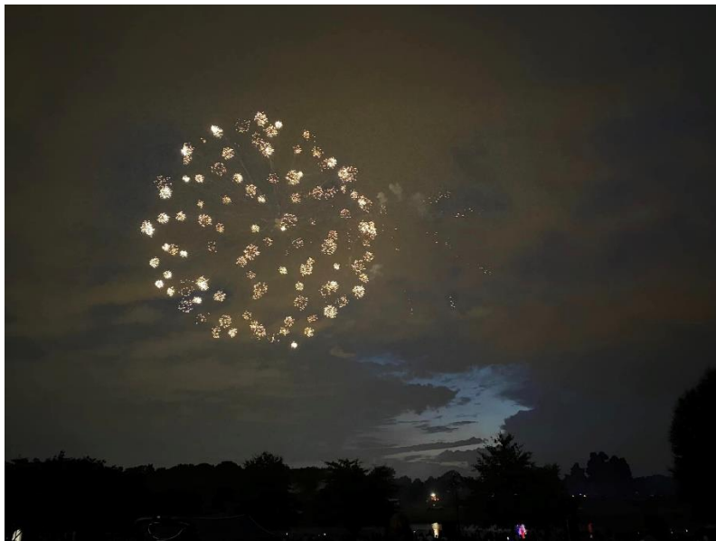
Celebrating Independence Day in the Town of Bladensburg

4229 Edmonston Road, Bladensburg, MD 20710