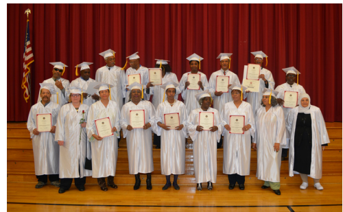
GATCCS, graduation ceremony at Elizabeth Seton High School.

The program is offered primarily to Town of Bladensburg residents but open to individuals living in surrounding communities. The free Workshops are held every Wednesday from 10:00 AM – 1:00 PM at the Bladensburg Community Center.