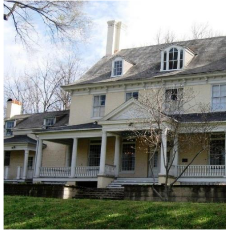
The historic Bostwick House, built in 1746, is located in Bladensburg.