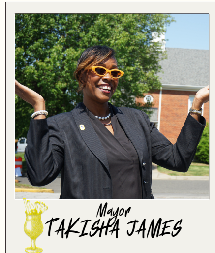
Mayor TAKISHA JAMES