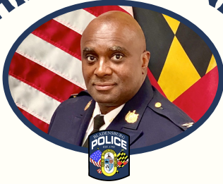
A message from your Bladensburg Police Department Chief