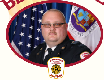
A message from your Bladensburg Volunteer Fire Department Chief